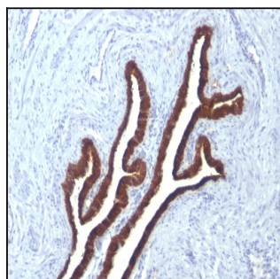
Formalin-fixed, paraffin-embedded human Ovarian Carcinoma stained with Cytokeratin 7 Monoclonal Antibody (KRT7/760 + KRT7/903)

Flow Cytometry (1-2ug/million cells); Immunofluorescence (1-2ug/ml); Immunohistochemistry (Formalin-fixed) (1-2ug/ml for 30 minutes at RT)(Staining of formalin-fixed tissues requires heating tissue sections in 10mM Tris Buffer with 1mM EDTA, pH 9.0, for 45 min at 95°C followed by cooling at RT for 20 minutes)