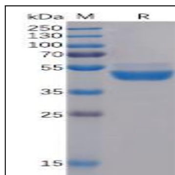
Figure 1. Human TIGIT Protein, mFc Tag on SDS-PAGE under reducing condition.