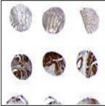
Fig:2 Six representative cores from a human gastric carcinoma formalin-fixed, paraffin-embedded tissue microarray stained for m Bid expression using 20-1034 at 1:2000. Hematoxylin-eosin counterstain.

Fig:1 Formalin-fixed, paraffin-embedded human gastric carcinoma tissue array stained for m Bid expression using 20-1034 at 1:2000. Hematoxylin-eosin counterstain. Variable Bid expression is seen between patient samples.