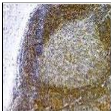
Fig:3 Immunohistochemical analysis of Livin in formalin-fixed, paraffin embedded human tonsil (secondary nodule) using 20-1069 at 1:2000. Hematoxylin-eosin counterstain.